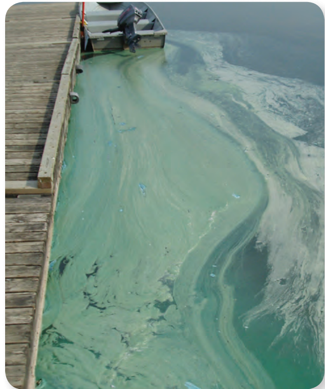
Blue-green algae thrives in warm, shallow, slow-moving water. Blooms are commonly found near docks and shoreline areas.

The Ontario Drinking Water Quality Standard for microcystin-LR (a common algal toxin) is a maximum acceptable concentration of 1.5 micrograms per litre, which is the same as 1.5 parts per billion. It is rare for treated water tests in Ontario to exceed this standard, but precautions should still be taken when a bloom occurs.