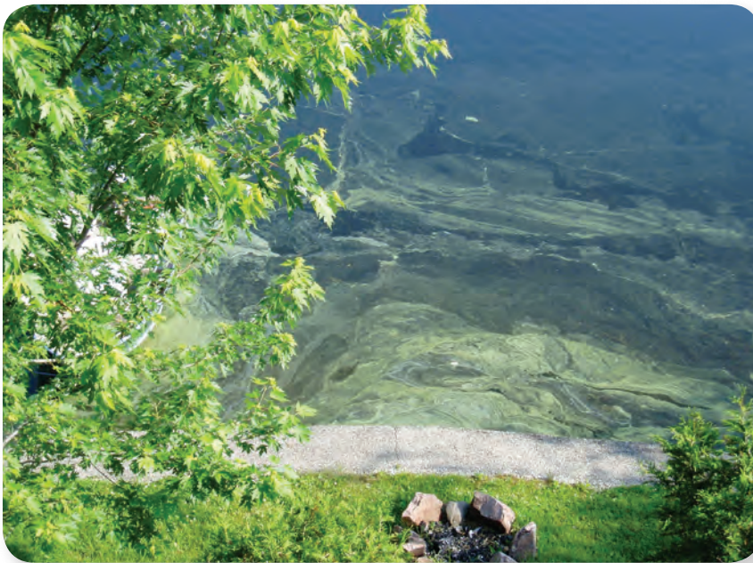
Colonies of microscopic blue-green algae appear on a lake during a bloom. Blooms occur mostly during late summer and early fall.

Human activities can promote the growth of blue-green algae. For instance, agricultural, urban and stormwater runoff, effluent from sewage treatment plants and industry, and leaching from septic systems can elevate the levels of nutrients in water bodies, which can promote algae growth. Reducing or eliminating nutrient inputs from these sources is a proactive way to reduce the occurrence of blue-green algal blooms.